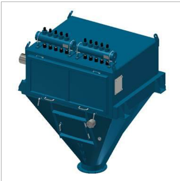
Powervac filter with conical bottom discharge.