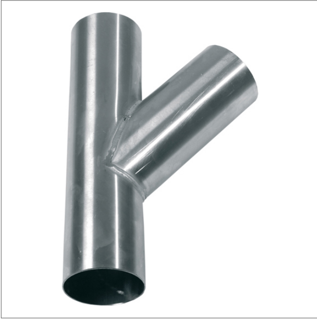
STBP - Branch pipe 45° galvanized

Branch pipe STBP is manufactured in welded galvanized design, with straight edges. The branch is 45°. Fitted in a high vacuum system with PICO coupling.