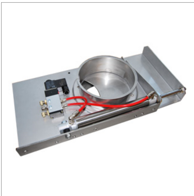
AUDS - Sliding damper pneumatic stainless AISI 304

Declaration of conformity according to EU Directive 2006/42/EC. Be aware that the unit may not go into service until the machine or the system it is to be included in, complies with the requirements of the EU machinery directive.